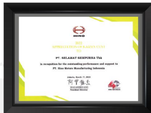
Hino Awards (2010, 2011, 2019 - 2021)