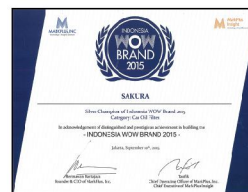
WOW Brand Awards (2015-2016)