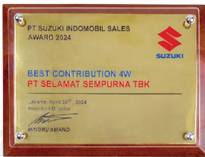
Suzuki Awards (2010, 2011, 2019 - 2022)

ADR Group Received Many Prestigious Awards & Appreciations Locally & Internationally