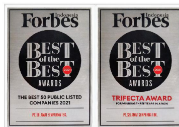
Best of the Best Awards (2021)