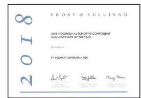
Frost & Sullivan Awards (2010, 2016, 2018)