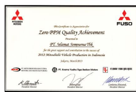
Mitsubishi Awards (2013-2015)