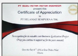
Isuzu Awards (2010, 2012)