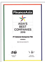
Finance Asia Awards (2014, 2016)