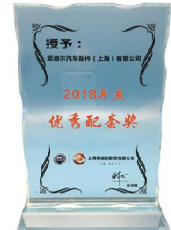
SAIC/SDEC Awards (2012-2018)